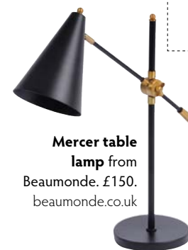
Mercer table lamp from Beaumonde. £150. beaumonde.co.uk