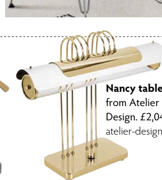
Nancy table lamp from Atelier Interior Design. £2,040. atelier-design.co.uk