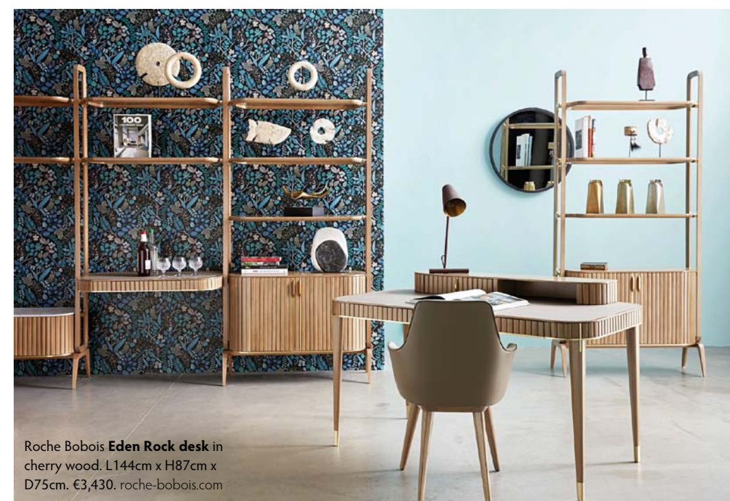
Roche Bobois Eden Rock desk in cherry wood. L144cm x H87cm x D75cm. €3,430. roche-bobois.com

You might like to consider a chair that matches in with the room's furniture rather than a typical office chair, but make sure it's supportive and comfortable if you're going to be sitting for hours.