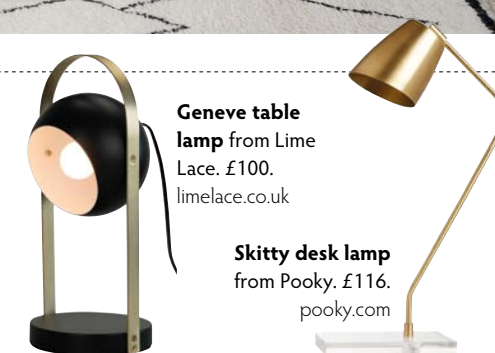
Geneve table lamp from Lime Lace. £100. limelace.co.uk