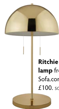
Ritchie table lamp from Sofa.com. £100. sofa.com