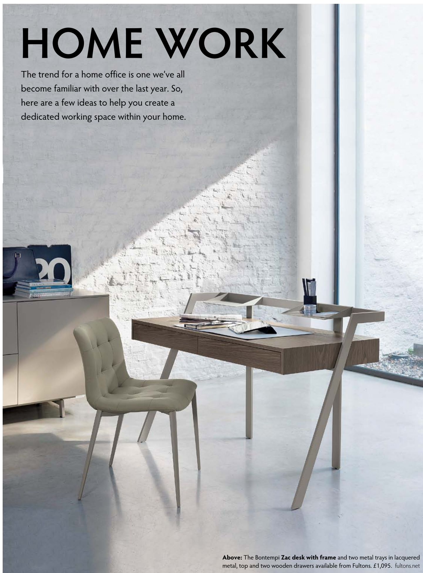
Above: The Bontempi Zac desk with frame and two metal trays in lacquered metal, top and two wooden drawers available from Fultons. £1,095. fultons.net

The trend for a home office is one we've all become familiar with over the last year. So, here are a few ideas to help you create a dedicated working space within your home.