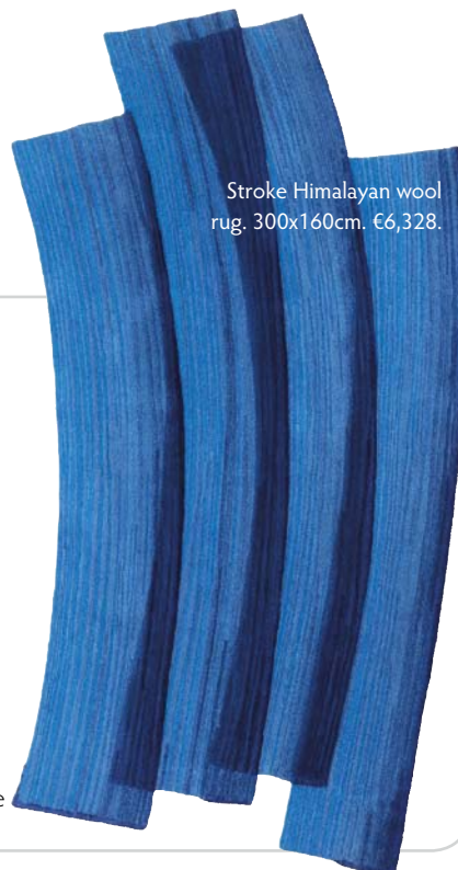
Stroke Himalayan wool rug. 300x160cm. €6,328.

DFS believes the trend for adaptable living is a key one for 2021. 'This year we've spent more time in our homes than ever before and living rooms are now the designated space for relaxing, exercising, working and so much more,' comments Rob Ellis, Head of Design at DFS. 'With our homes having to multitask, that adaptability needs to extend to our sofas as well. Our Sofables modular range gives people the option to expand or update their sofa shape as their needs change. With an exciting choice of fabrics and colours to play with, the Sofables range also invites you to get creative, and build a sofa that is finely tuned to your style and way of life, for the long-term.' The new Sofables range is made up of modular individual seat units, arm/back units, back pillows and optional extra scatter cushions. Each piece can easily be moved and rearranged into different configurations to create a whole host of different sizes and shapes. From separate armchairs for working and relaxing, to a spacious corner sofa for the whole family to cuddle up and enjoy film night, the uniqueness is the product's adaptability – adding new sectionals to the range as your needs change or family grows couldn't be easier. dfs.ie dfs.co.uk