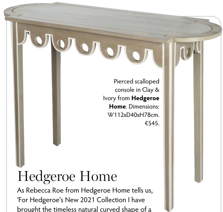
Pierced scalloped console in Clay & Ivory from Hedgeroe Home . Dimensions: W112xD40xH78cm. €545.