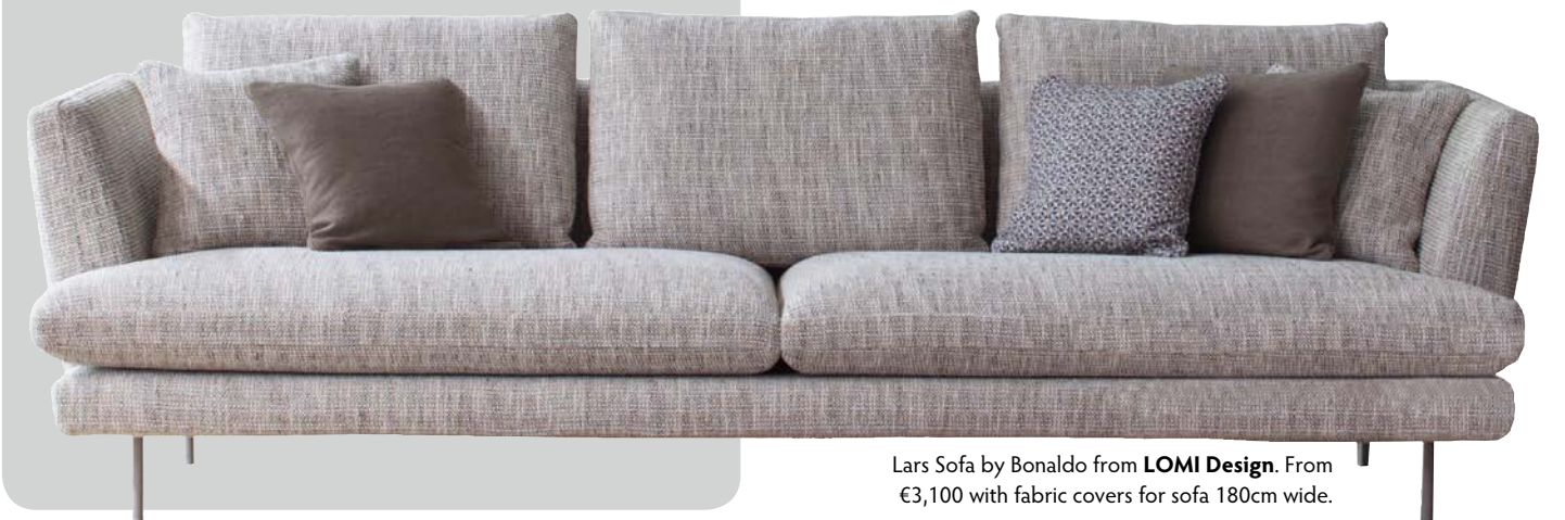
Lars Sofa by Bonaldo from LOMI Design. From €3,100 with fabric covers for sofa 180cm wide.

'As a busy mum my absolute must-have for 2021 is a plush new sofa,' comments Lorraine Stevens from LOMI Design. 'There is nothing better than being able to relax after a busy working day and where better than on a cosy sofa with a good book or a movie. I love this Lars sofa from our Italian brand Bonaldo. It comes with removable covers as standard for all those spilled drinks and kids yogurts that need washing out. There are lots of sizes with both low and high arm options along with modules to create that cosy corner sofa if you have the space. lomide