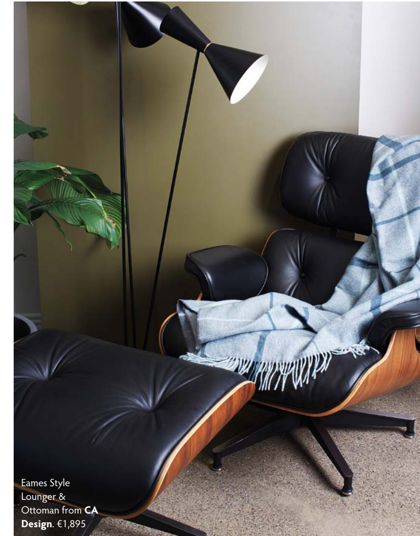
Eames Style Lounger & Ottoman from CA Design. €1,895