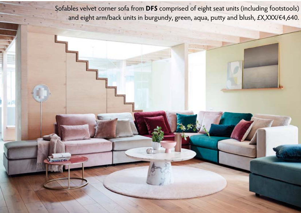
Sofables velvet corner sofa from DFS comprised of eight seat units (including footstools) and eight arm/back units in burgundy, green, aqua, putty and blush, £X,XXX/€4,640.