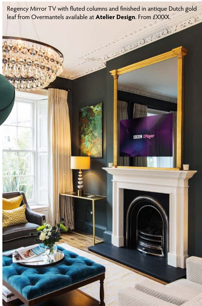
Regency Mirror TV with fluted columns and finished in antique Dutch gold leaf from Overmantels available at Atelier Design. From £XXXX.