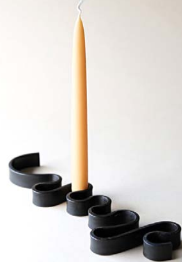
Black Meander candleholder from Superfolk . Also available in brass. €160. superfolk.com

As Emily Maher from Lost Weekend explains, 'A beautiful rug pulls an interior design scheme together. It's a piece of art on the floor, a great way to express your individuality through your interior design. Shown here, Stroke is part of the Gesture collection from Italian design company cc-tapis. This collection is made up of five new projects which explore gesture as the root of artistic expression and were designed during lockdown. Stroke and many more pieces will be exhibited in our showroom, from the first week in December until the end of January. lostweekend.ie