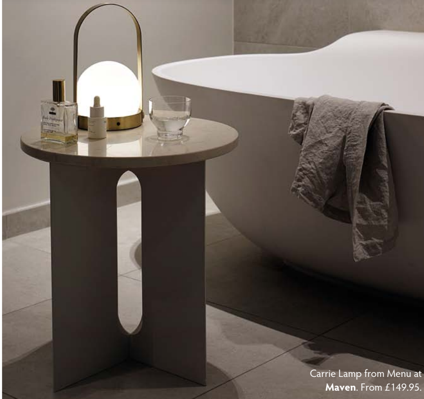
Carrie Lamp from Menu at Maven . From £149.95.