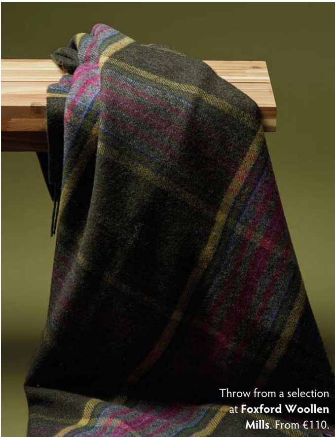
Throw from a selection at Foxford Woollen Mills . From €110.