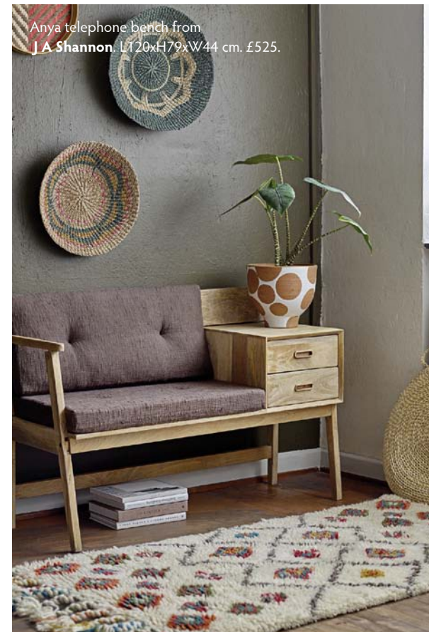
Anya telephone bench from J A Shannon . L120xH79xW44 cm. £525.