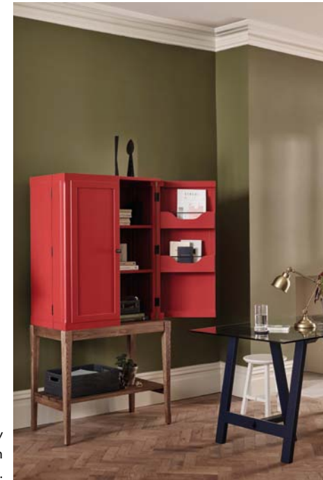
Neptune's Ardingly Cabinet. From €1,635/€2,095.