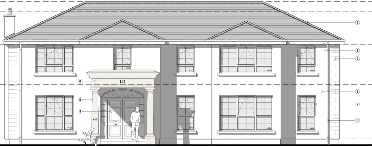
Front Elevation [East] Scale 1:50